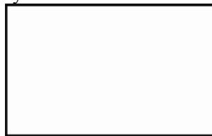
Fig. 1. The “perfect” rectangle

The rectangle that have dimensions ratio equal to \varphi is the “perfect” rectangle (Figure 1). There is a graphical methodology to draw the perfect rectangle starting with a square and a semicircle [4]. Allegedly, this methodology was developed by the ancient Greeks. There are claims that this rectangle is the most beautiful to the human eye.