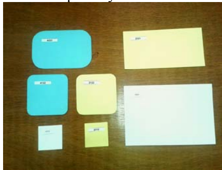
Fig. 4. Some of the rectangles used in experiment