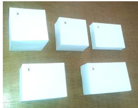
Fig. 5. The rectangular boxes used in experiment