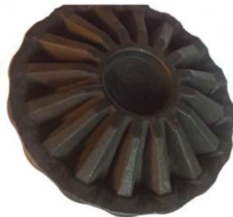
Fig. 2. Precision forged straight bevel gear [3]