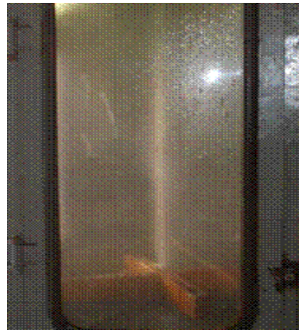
Fig. 6. The aspect of the jet being pulverized at a 35 bars pressure