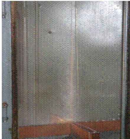
Fig. 5. The aspect of the jet being pulverized at a 40 bars pressure

Figure 6 shows the pressure for realizing a certain density for briquettes in a strong connection to the initial density of the straw cutting.