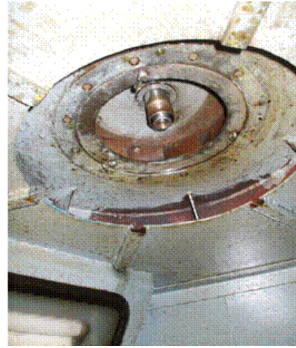
Fig. 4. The image of an injector attached to the conduit of vorticity air

The experiments have confirmed the measurement of the pulverization angle symbol and a uniform/unvarying repartition of particles in the transversal section of the jet, as shown in Figures 5 and 6. The image in Figure 6 is for a pulverization pressure of 40 bars, and that from Figure 6 for a pressure of 35 bars.