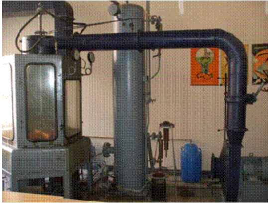
Fig. 3. The experimental stand for the study of pulverization