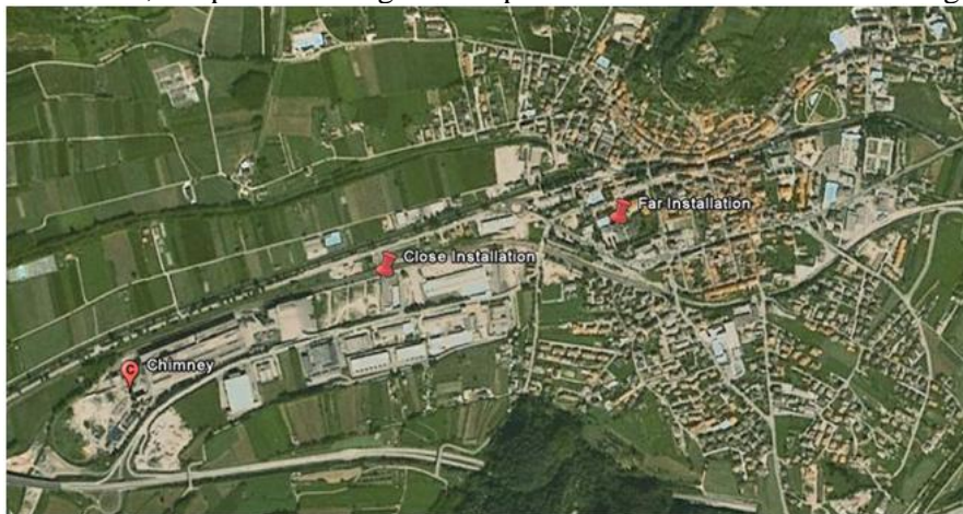
Fig. 3. Selected positions for the deposimeters (close and far from the plant).

The first step of the activities was the verification, by diffusion modeling, of the area of interest for the PCDD/F depositions. The “far” site shown in Fig. 3 was selected as representative both of the depositions from the stack and of the diffused emissions (not conveyed). The “close” site of Fig. 3 was selected as representative mainly of the diffused emissions incidence. The first is at a distance of around 1400 m (from the stack) and the second at a distance of around 700 m (from the stack; the plant buildings develop from the stack towards the village).