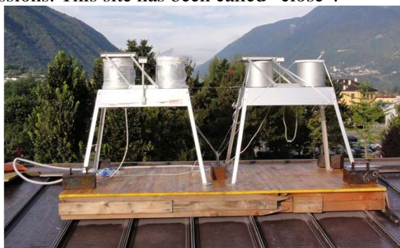
Fig. 2. Wet&dry deposimeter on the roof of the selected building

An additional Depobulk ® device was positioned in a site selected thanks to the diffusion model results in order to check the incidence of the sintering plant form diffuse emissions. This site has been called “close”.