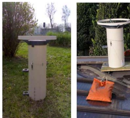
Fig. 1. Conventional deposimeter: before installation (left) and on the roof (right).

A vetropyx Depobulk ® deposimeter [3] with its body in glass (Fig. 1) was selected, able to capture the overall deposition of PCDD/F generally in a period of one month around. A special ring avoids interferences from birds excreta.